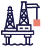
OIL, GAS AND MARINE