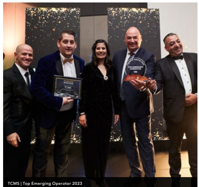
TCMS | Top Emerging Operator 2023