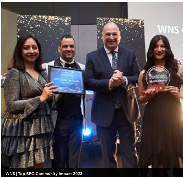
WNS | Top BPO Community Impact 2023