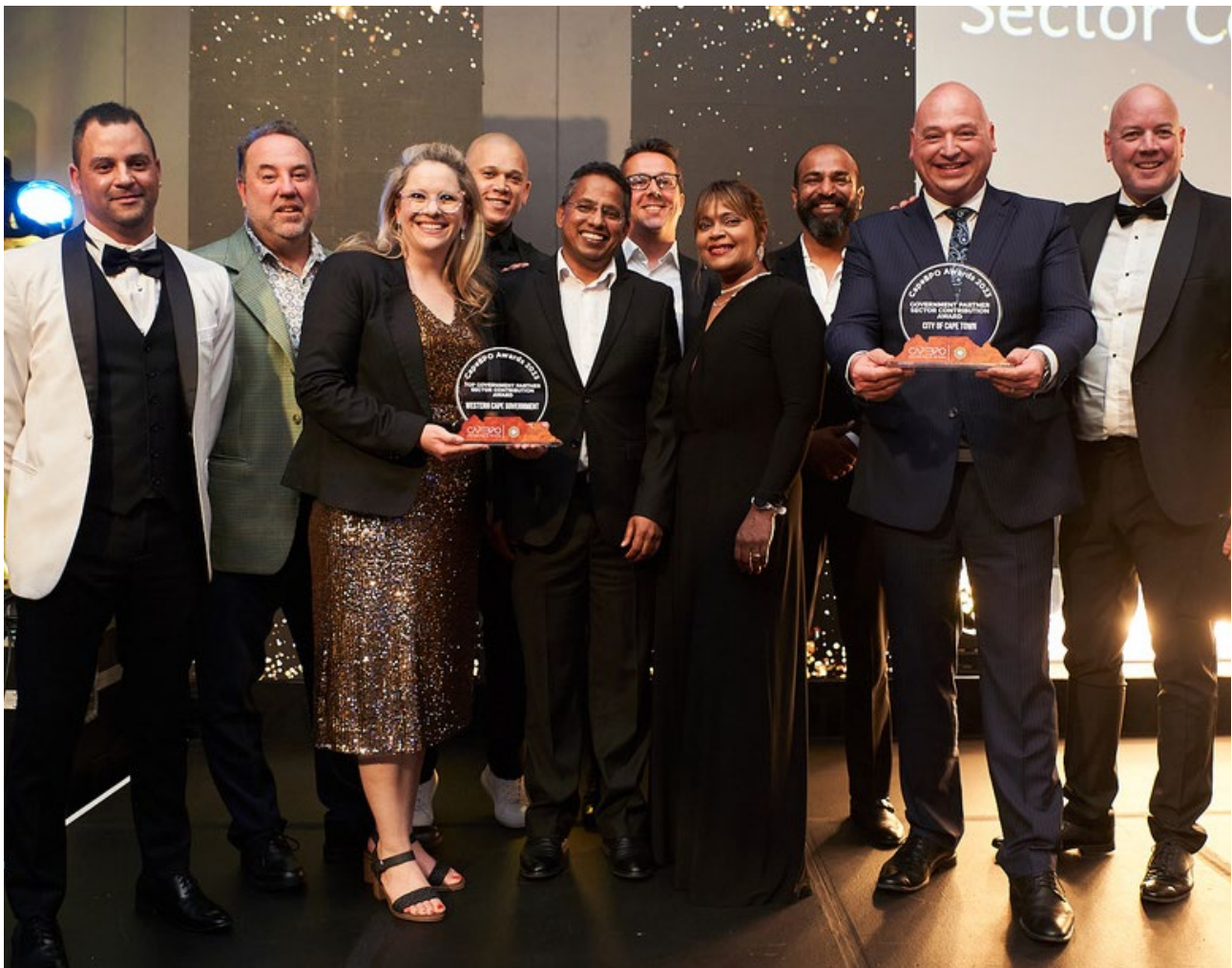
City of Cape Town and Western Cape Government | Government Partner Sector Contribution Award 2023