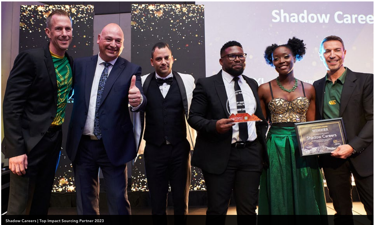
Shadow Careers | Top Impact Sourcing Partner 2023